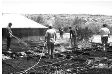
By the time someone thought to take a picture, the greenhouse was already down, and the remaining embers were being doused by staff and board members.

We got two 1/2 inch garden hoses going which did nothing to impress the fire. I have fought fires for the U. S. Forest Service for 30 years and knew that we were looking at the end of all the greenhouses with fire reaching Vicky Pioche's house three miles up river in very short order.