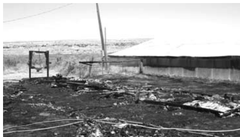
Thank God for His protection.

What a blessing to see God's hand at work to protect His mission. The whole green house was fully consumed in approximately 10 minutes and collapsed