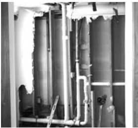
Unfortunately, as I am sure you know, when one thing needs repaired, it often means that you have to make a BIG mess to get to the problem and you end up with a BIG fix-it job.